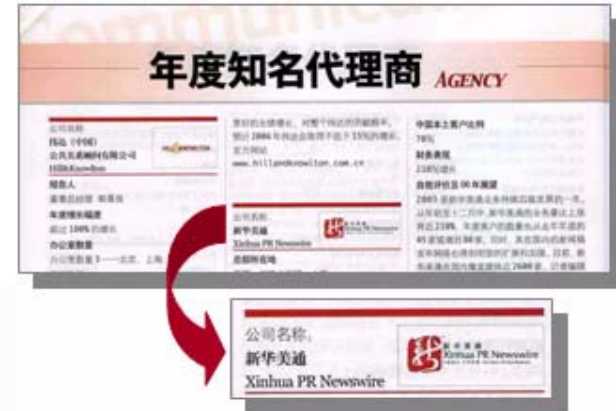
XPRN ranked Communications Monthly's "12 Players in the PR Industry of the Year" in China