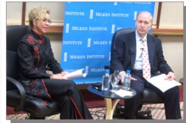
Announces China Indicators with Milken Institute

... As the Pioneers in Each of Our Service Lines