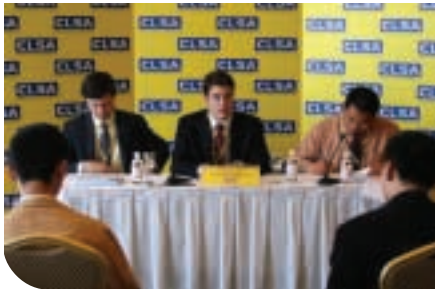
CLSA China Forum 2004 – Media Briefing for CLSA Analysts

Our IR/PR professional services under the Fortune China brand name have been maintaining a strong presence in the China market. Our expertise and professionalism have allowed us to engage many reputable clients.