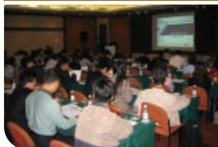
Investor relations training programs

During the year, XPRN became a preferred partner with Special Olympics East Asia in Beijing. This partnership helps to bring greater awareness to the world of the particular quality of the athletes competing at the Special Olympics. XPRN plans to continue the relationship in the coming year.